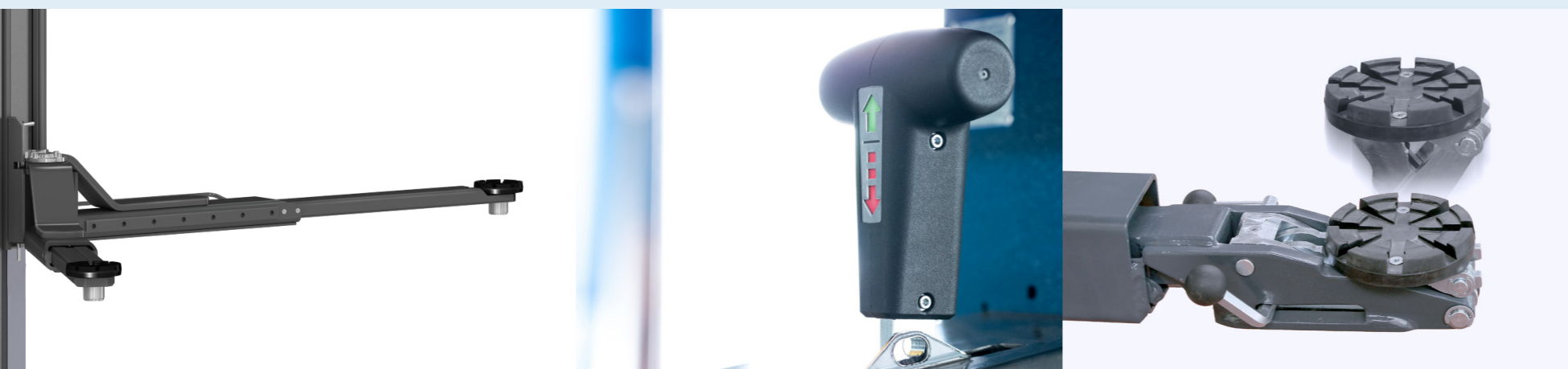
SC (Sports car arms): extremely flat construction. Very sturdy, made of solid material. Especially suitable for very low and wide sports cars.