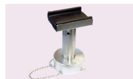
U-form adapter 150-233 mm