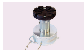
Height adapter 155-245 mm