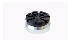
Height adapter 44 mm