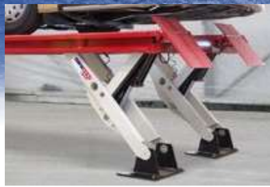
Easy access Y-shaped construction