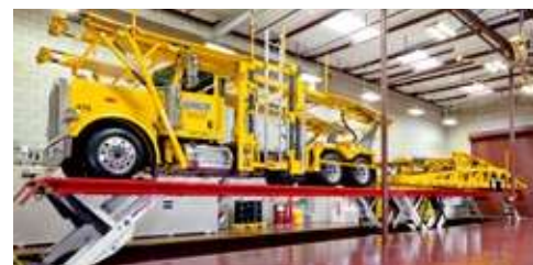
Extra flexibility for very long vehicles