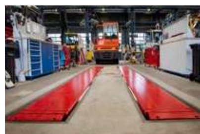
Flush mounted with Reverse Roll-Off

Safety is one of Stertil-Koni's top priorities. The automatic Reverse Roll-Off Protection System with optimum safety prevents the vehicle from inadvertently rolling-off of the lift. This system also effectively lengthens the platform lengths compared to conventional platform lifts. This option is available for all SKYLIFT models and can be fitted to existing installations.