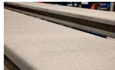
Stertil® Guard™ Anti-Skid Coating