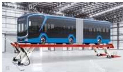
Platform lengths up to 14.5 metres