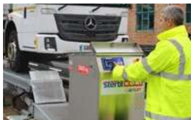
Stainless steel control console