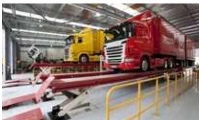
Various platform lengths

With a special synchronisation set and a bridging-piece between the two lifts, it is possible to use two SKYLIFT vehicle lifts safely and quickly as either a single long lift or simply as two individual lifts. The drive-on is just as safe and equally smooth as with a single configuration. This is due to the minimal amount of space between the two lifts.