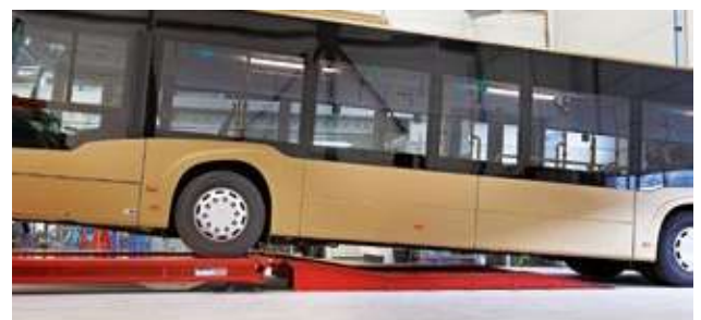
Versatile modular drive-on ramps