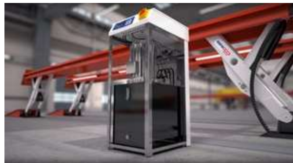
Removable side panels for easy maintenance