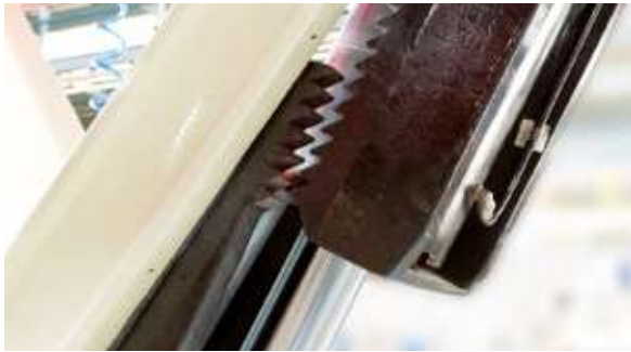
Mechanical Locking System

The mechanic can work ergonomically and safely standing upright under the vehicle. A toolbox trolley and other workshop equipment can easily be moved under the platforms.