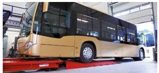
Fixed end-stops or "drive-thru" versions