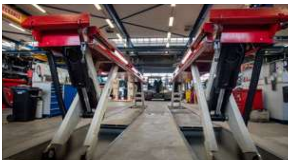
Automatic Recess Cover Plates