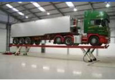
Completely vertical lifting operation

Stertil-Koni provides a complete range of heavy duty vehicle lifts and lifting equipment for customers all over the world. All Stertil-Koni vehicle lifts are designed and manufactured in-house by a team of specialists with expertise in the heavy duty vehicle lifting industry. Stertil-Koni is represented across the globe by local sales organisations, exclusive Stertil-Koni distributors, and a network of qualified Stertil-Koni Service partners. This makes Stertil-Koni the Number 1 in heavy duty vehicle lifting around the world.