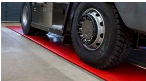
Flush with the floor and ideal for low clearance vehicles

Flush mounted, semi-flush mounted, or surface mounted each model is possible with the SKYLIFT. This heavy duty vehicle lift is suitable for a wide range of vehicles and workshop situations.