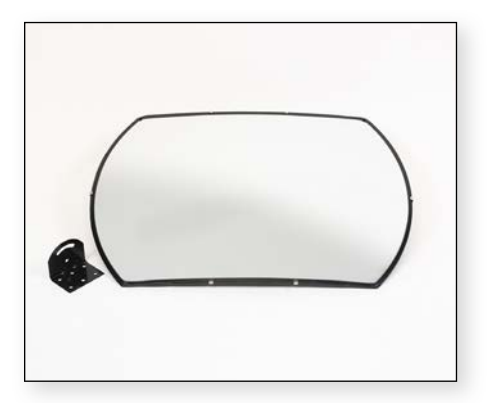
Convex Mirror 213-47-2