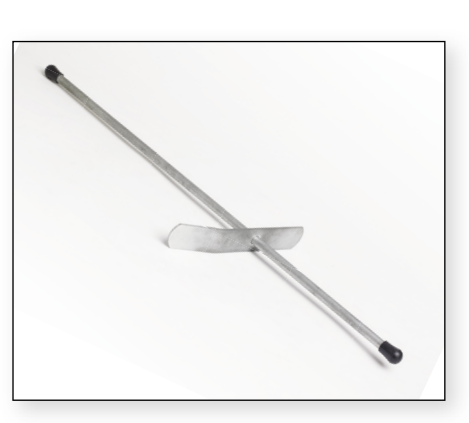
Brake Pedal Depressor WA15-S