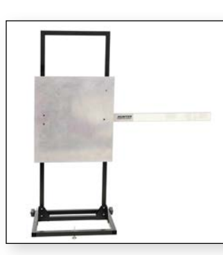
191-37-1 Reflective fixture