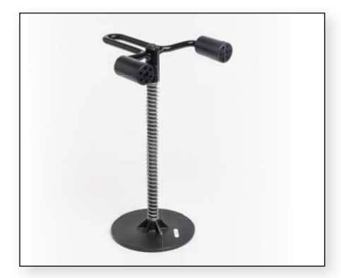
Steering Wheel Holder 28-75-1