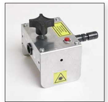
15-60-1 Double-ended laser aiming tool