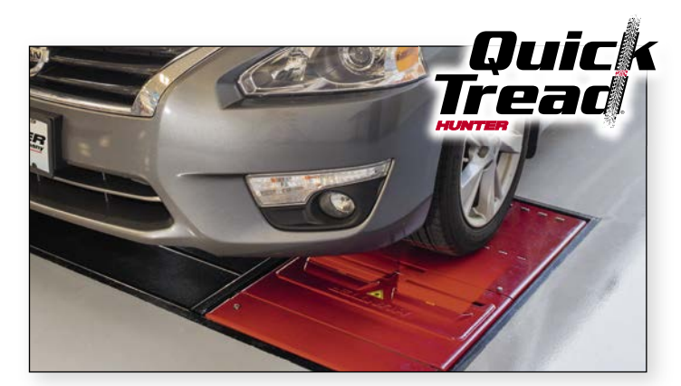
Quick Tread®* Drive-over tread depth measurement system

Tests battery to OEM specs. Sends results to console wirelessly in 10 seconds.