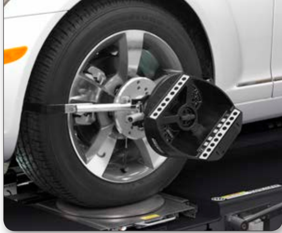
Targets contian no electronics to damage if dropped.