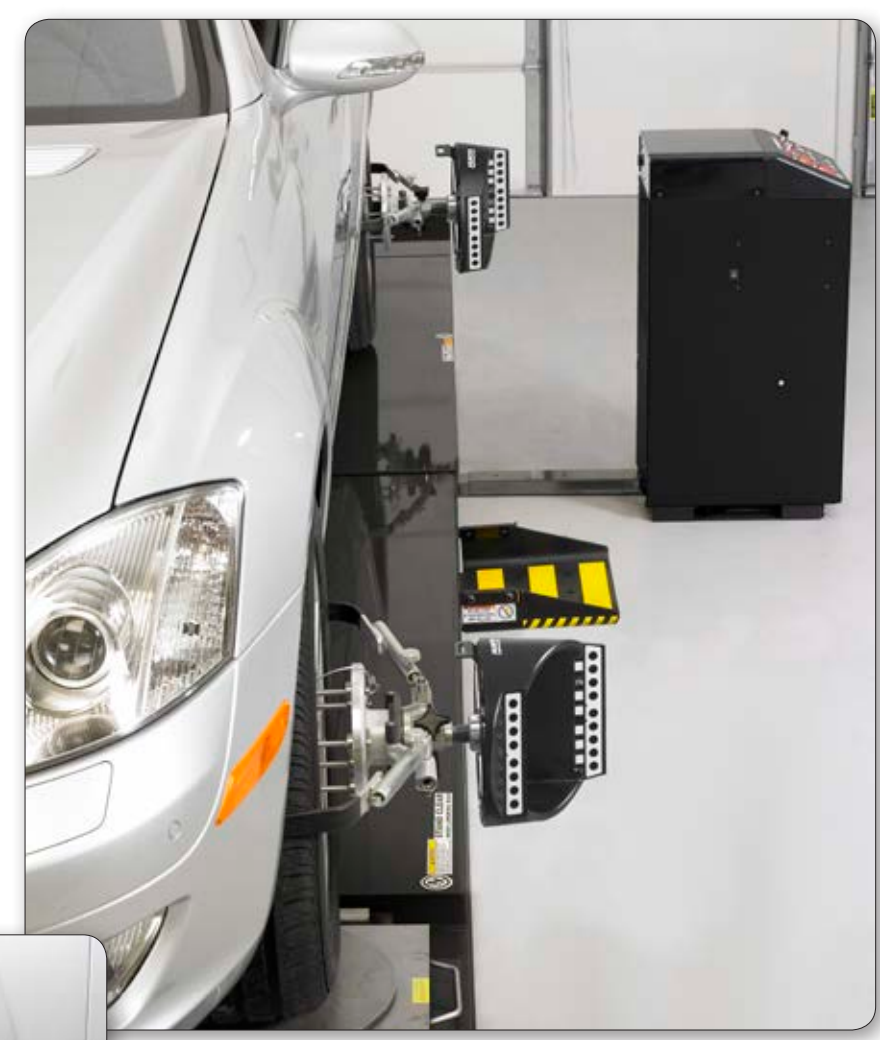
Lightweight, durable targets are easy to install.

HawkEye Elite® Sensors offer speed, durability, ease of use and are engineered to provide low long-term cost of ownership. Sensors have no electronics at the wheel, no batteries and no moving parts. Four high-resolution digital video cameras continuously measure wheel position and multi-dimensional modeling provides accurate, high-speed alignment measurements.