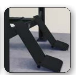
Low-Profile 2-Stage Ramps