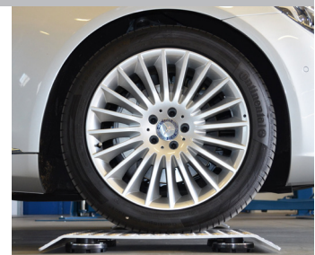
Drive-on tables (4 units) Art.-Nr. 235HL05130SET