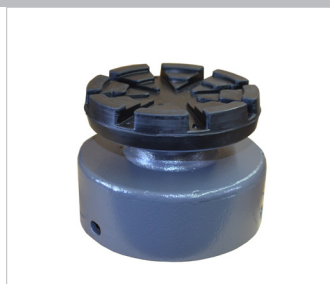
Height adapter 50mm (4 units) Art.-Nr. 232HEL48083SET