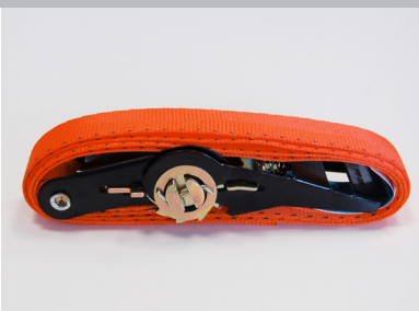
Lashing strap (2 units) Art.-Nr. 975086