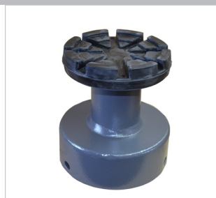
Height adapter 100mm (4 units) Art.-Nr. 232HEL48087SET